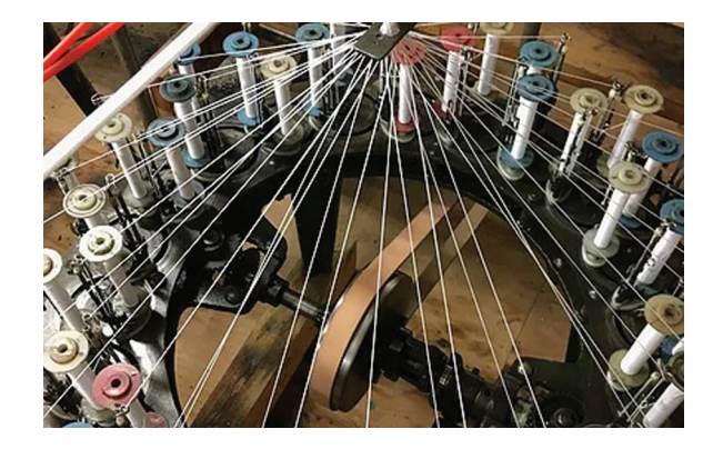
Waldoboro welcomes many different types of businesses.

But business does not stop there. As one of the region's largest towns, at 73-square miles, Waldoboro has significant amounts of rural area for growth in agriculture and aquaculture, as well as a business park for industries.